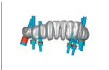
Fig 3 (above) PIC File showing implant position and angulation in relation to the prosthesis.