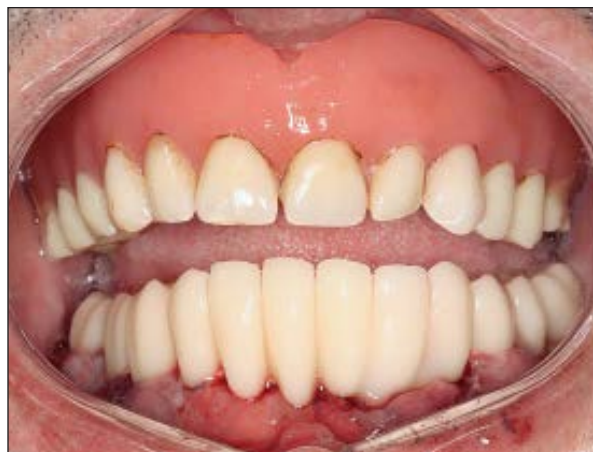
Fig 4 (right) Provisional immediate restoration placement.

Radiographic and clinical follow-up after 1 year showed a favorable evolution of the implants. No screw loosening or other mechanical or biologic complications were seen throughout this preliminary observation period.